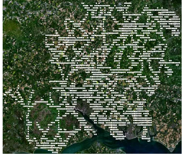
Figure 2: Road Ice Model Data Points Map

trivial due to the complexity and size of the input data.